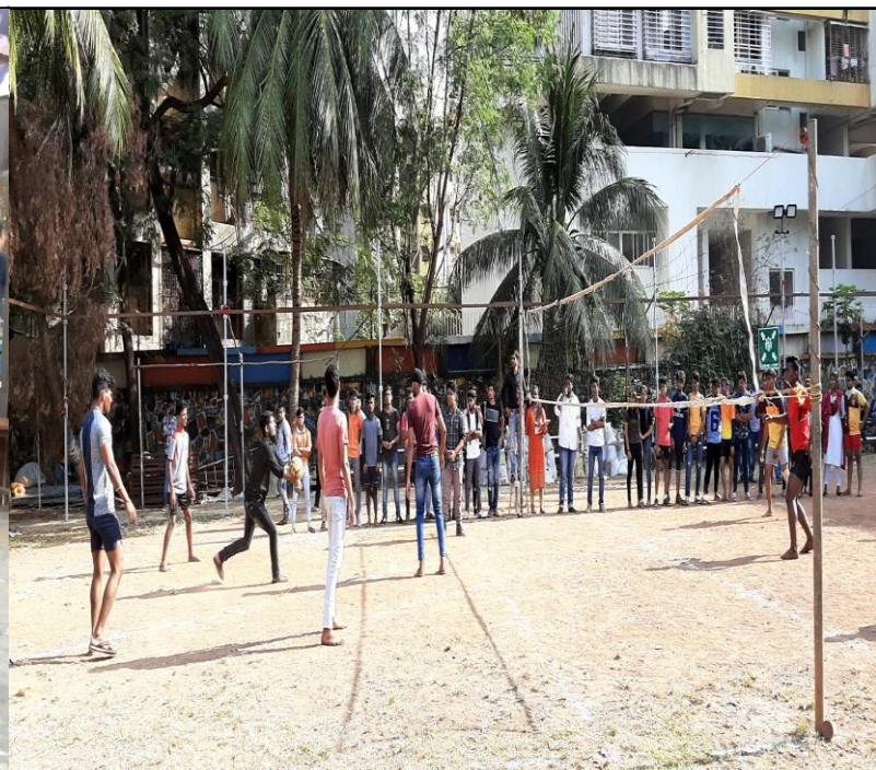
Volleyball - Boys