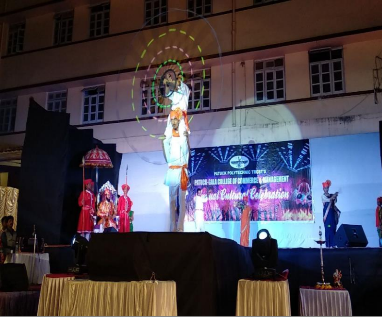
Annual Day - Pastoral Symphony