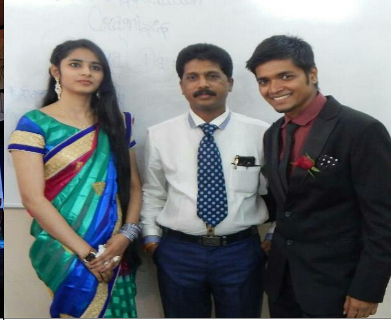
Saree & Tie Day