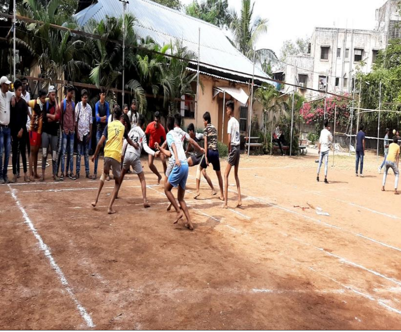
Kabbadi - Boys