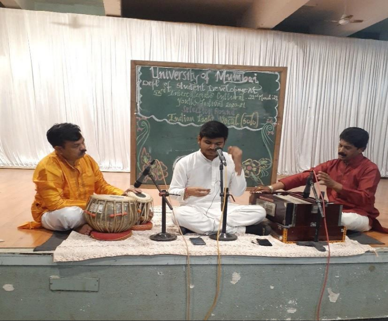
Indian Light Vocal