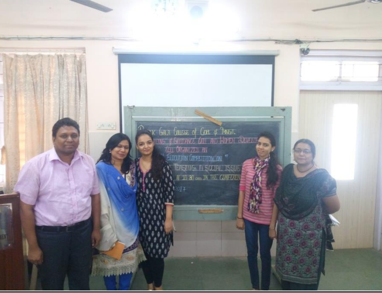
Elocution Competition - "Eve Teasing: A Social Issue"