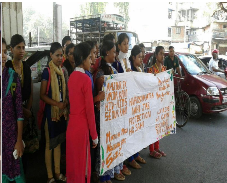
AIDS Awareness Rally