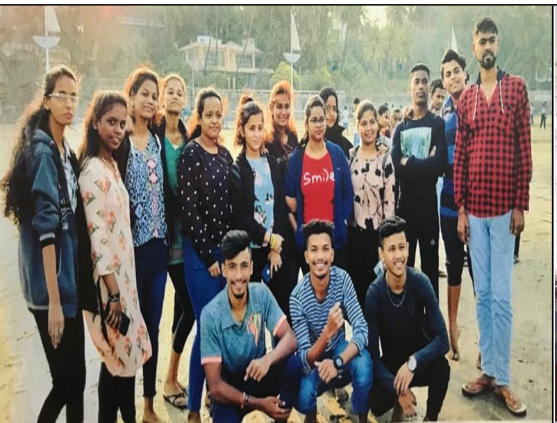
Street Play – Nari Shakti