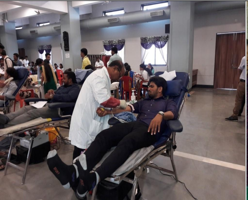
Blood Donation Camp, Thalassemia & Dental Checkup