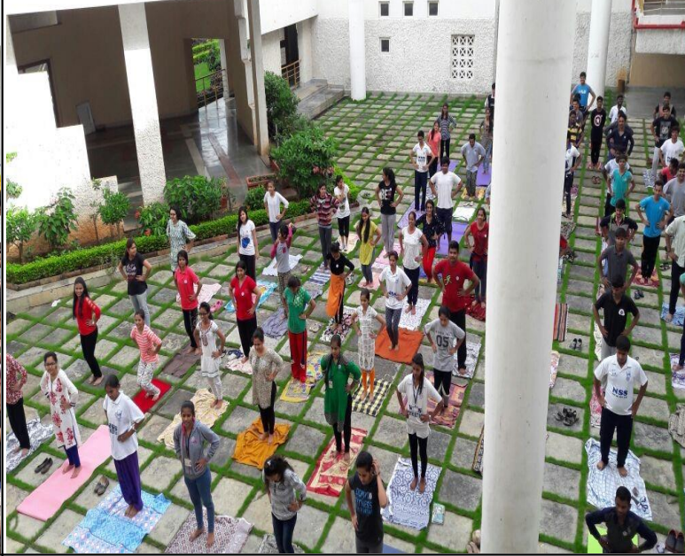
Yoga Divas Program – University of Mumbai