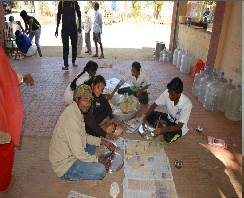
NSS Residential Rural Camp - Navjhe