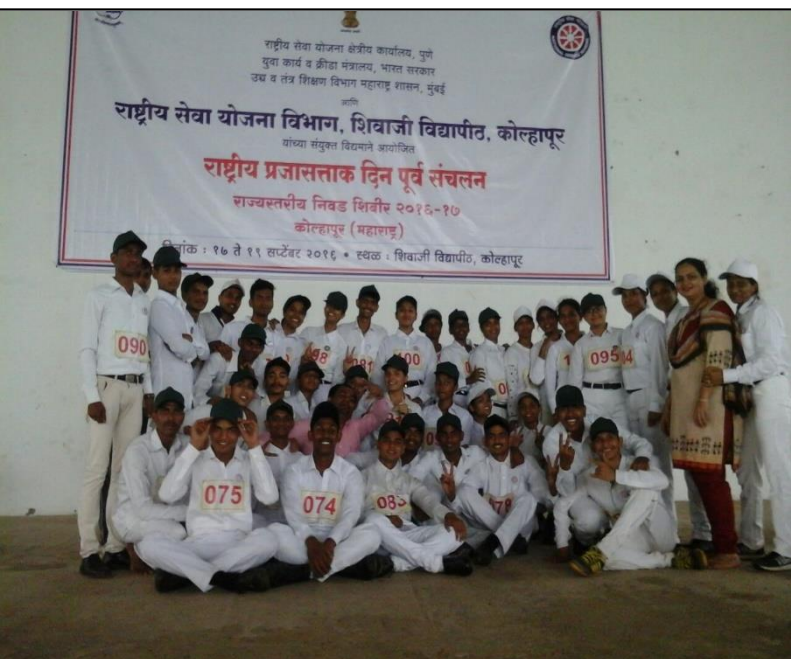
NRD/ SRD Parade - Kolhapur University