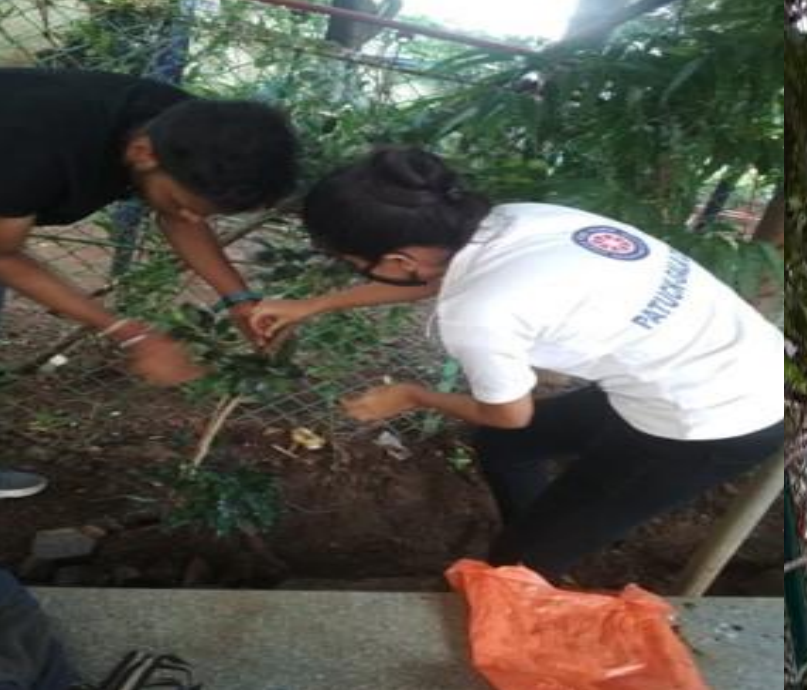
Tree Plantation in College