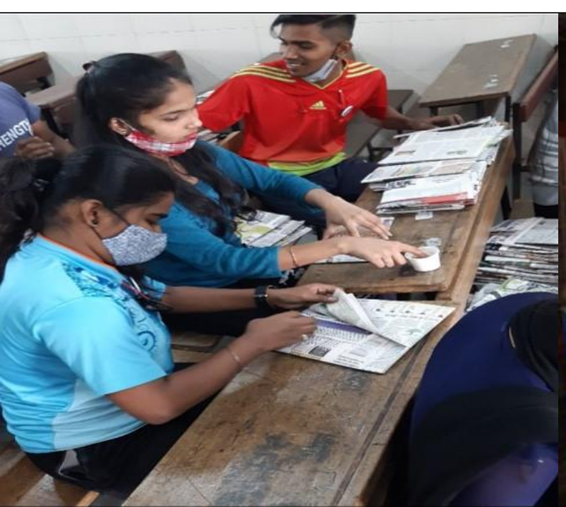
Paper Bag Making