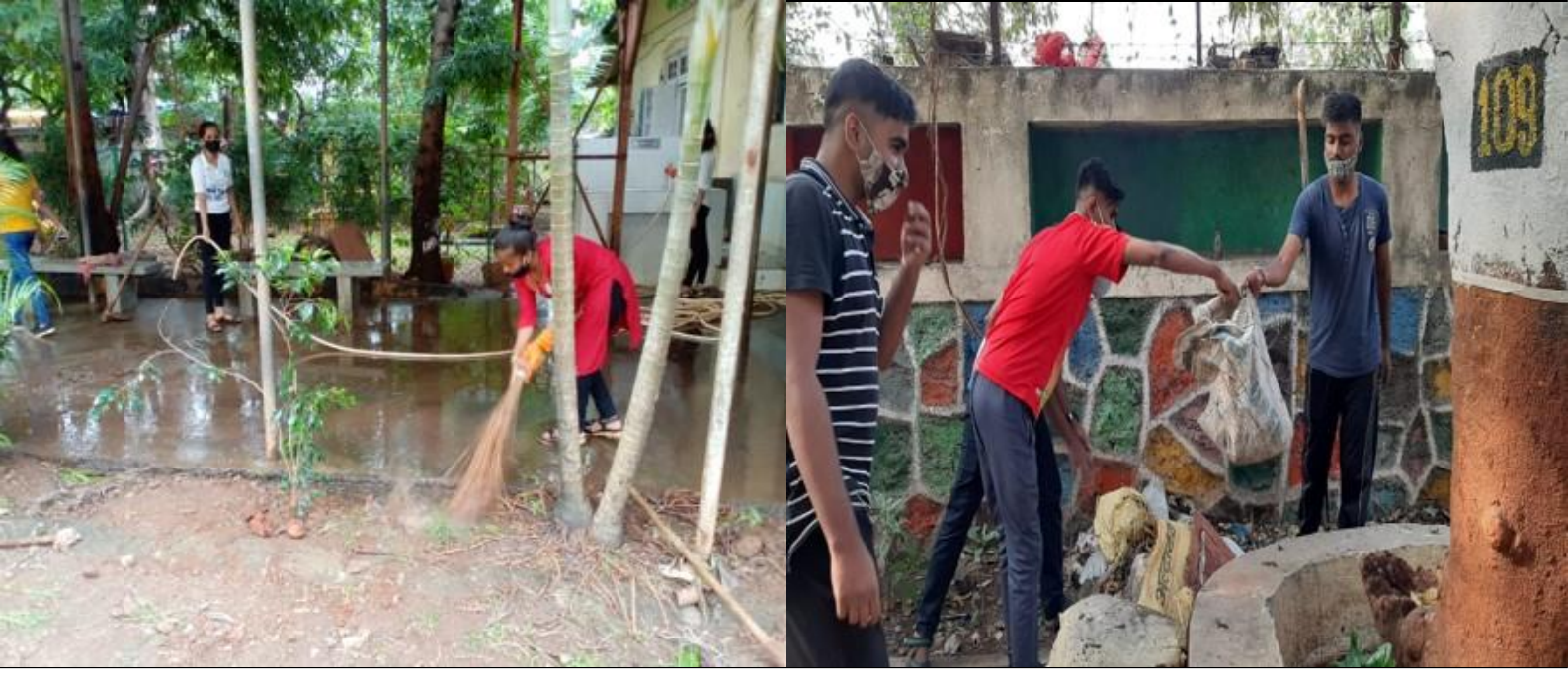
College Campus Cleaning Activity