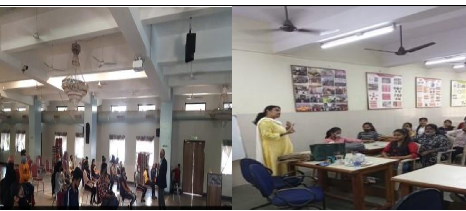
Military Leadership Program

Re-accredited with B++ grade by NAAC (2.77 CGPA)