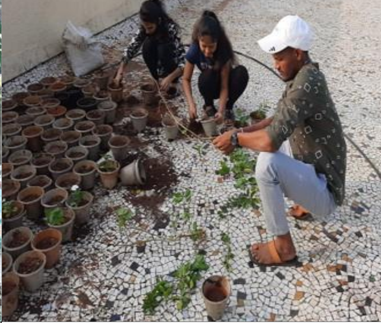
Nursery Gardening in College Campus