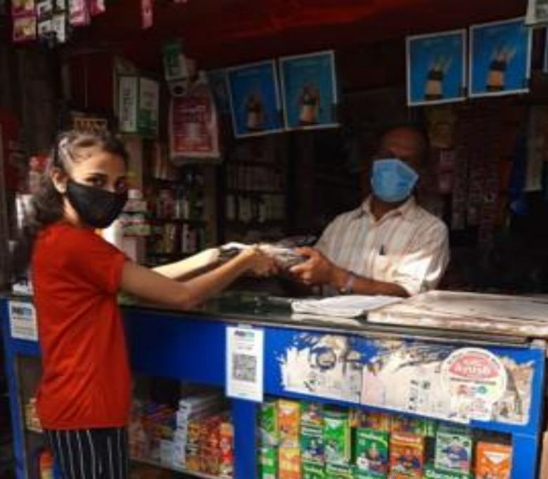
Paper Bag Distribution