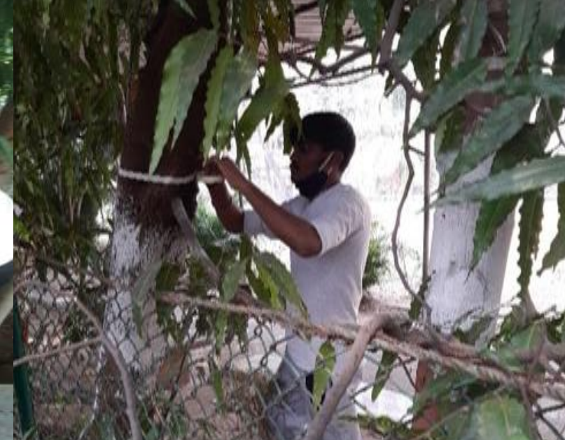
Tree Taxonomy at the College Campus