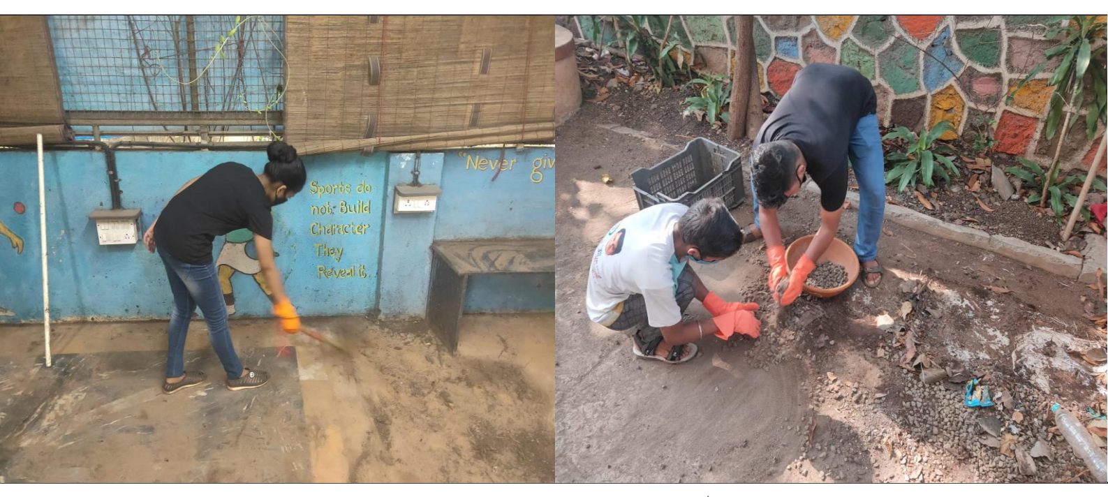
Campus Cleaning Drive by NSS Volunteers