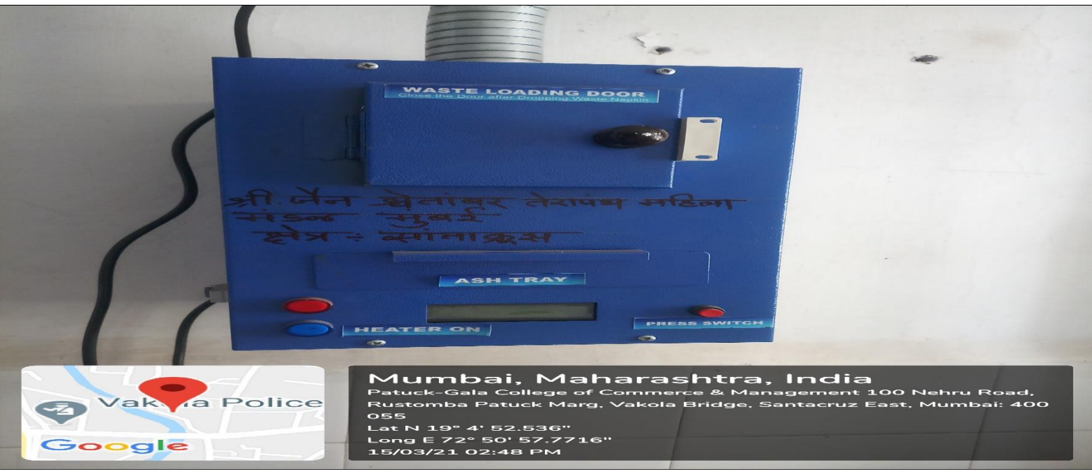
Incinerator Installed at the Campus to Dispose Soiled Sanitary Napkins