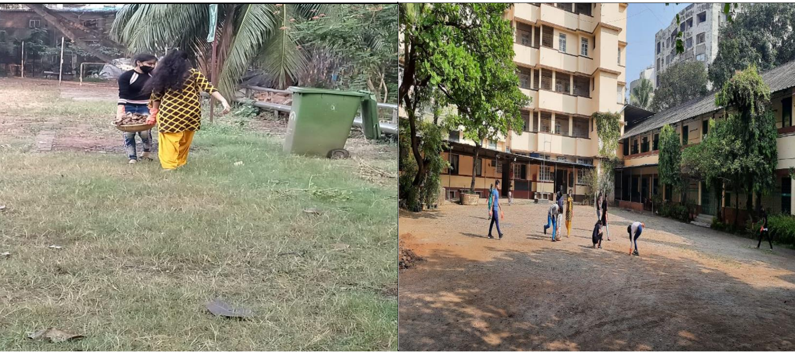
Campus Cleaning Drive by Students Council Members