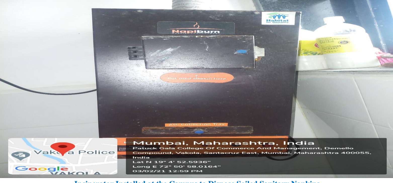
Incinerator Installed at the Campus to Dispose Soiled Sanitary Napkins