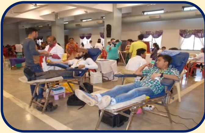
Blood Donation Drive