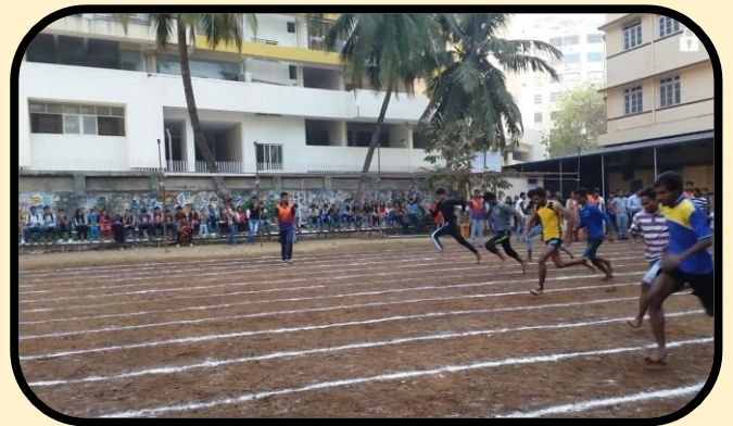
85 th Year Celebrations