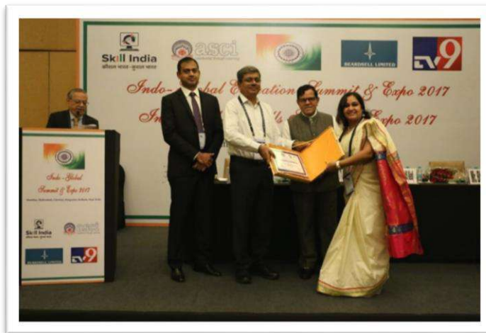
Principal Receiving Best Student Services and the Best Emerging Educational Institution