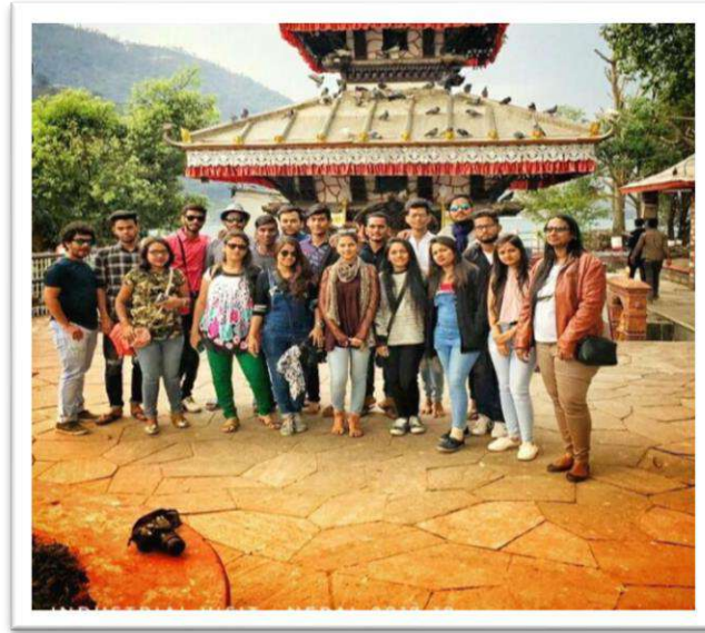
International Industrial Visit to Nepal