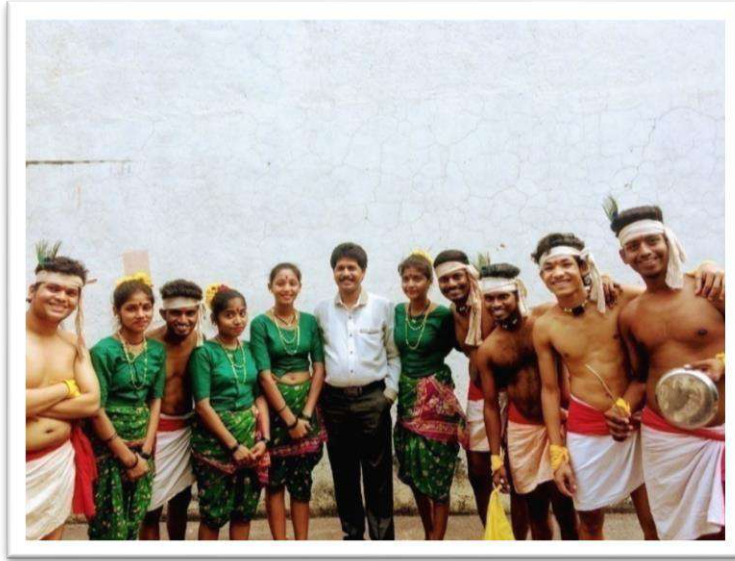
50 th Youth Festival Performing Arts