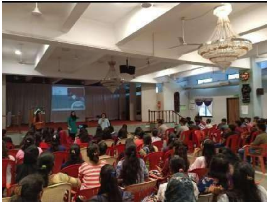
Technoserve Orientation and Selection Program