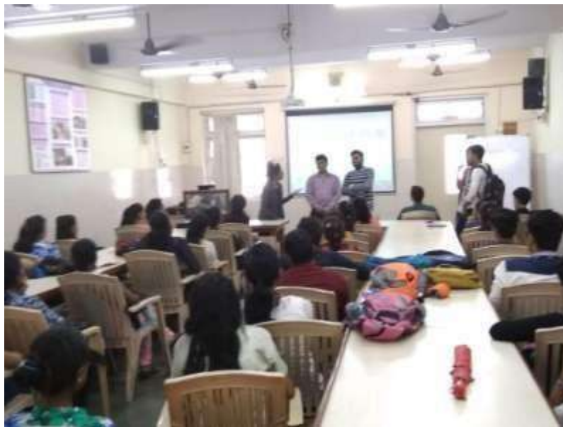
Movie Screening by the Anti Ragging Committee