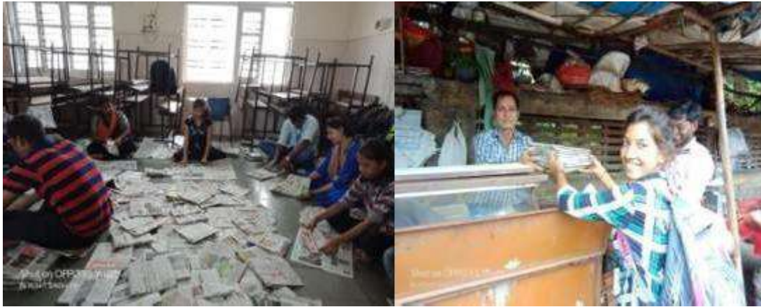
Paper Bag Preparation and Distribution