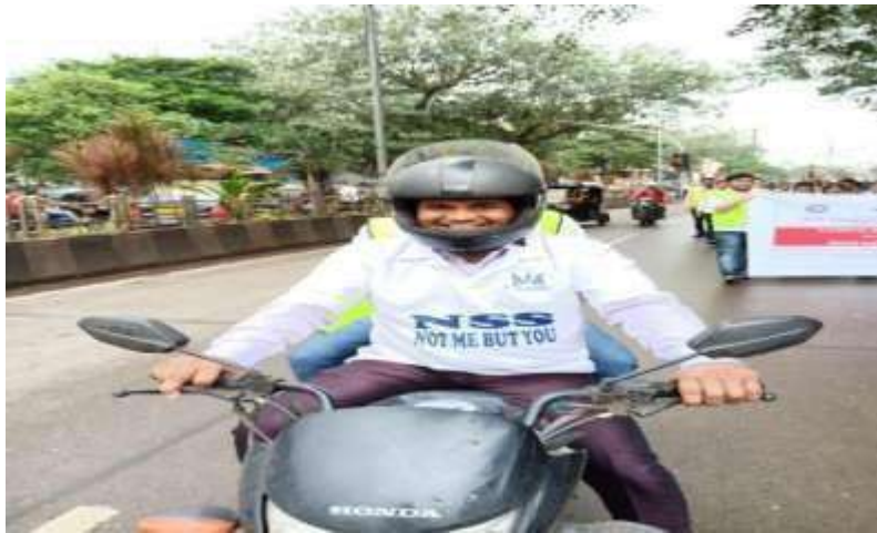
NSS Volunteers at the Road Safety Rally on Independence Day