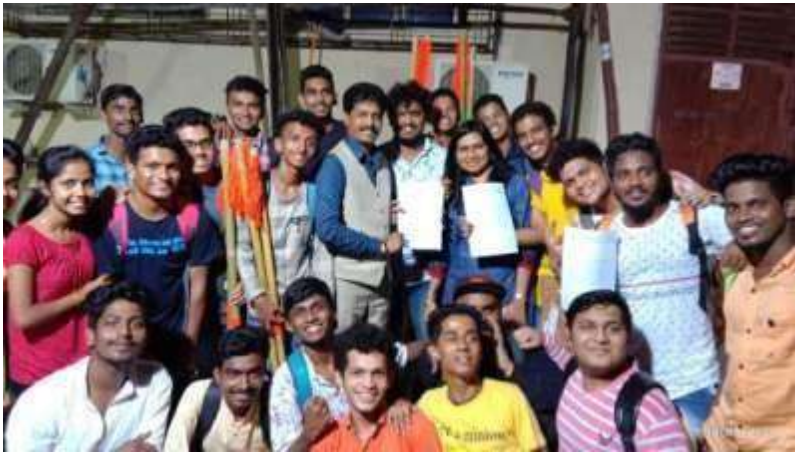
Students and Teachers on winning the Zonal round of the Youth Festival, University of Mumbai