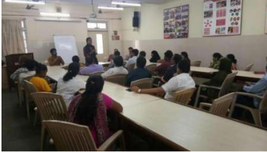
Parents Teachers Association Meet