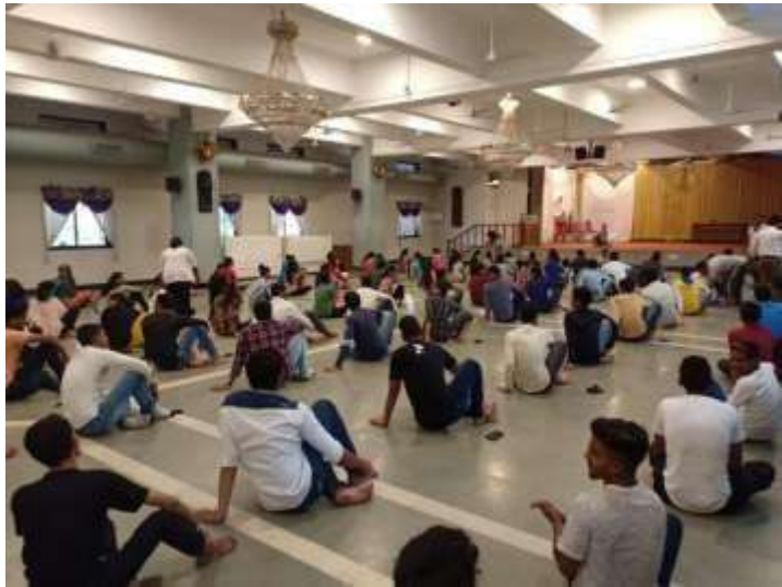
Celebration of the International Day