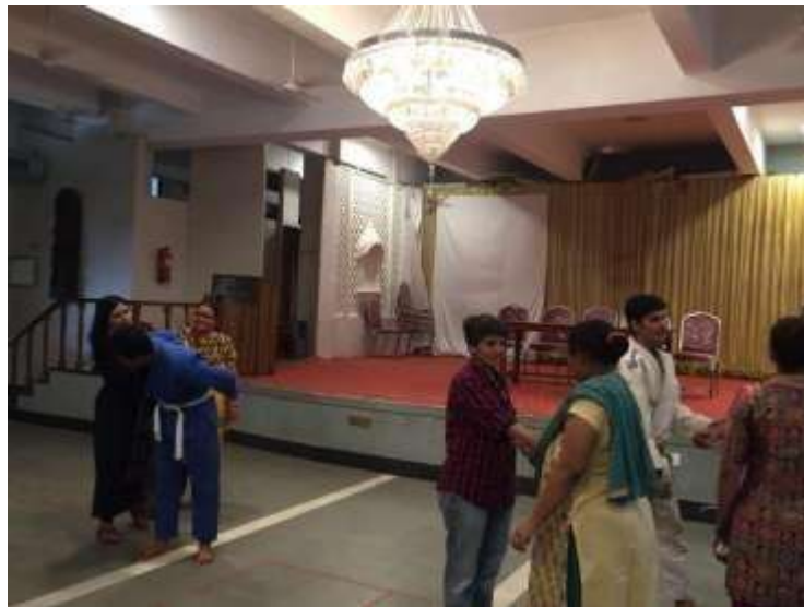
Self - Defense Workshop for Teachers