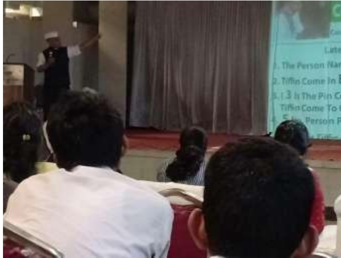
Dabbawalas Expert Lecture