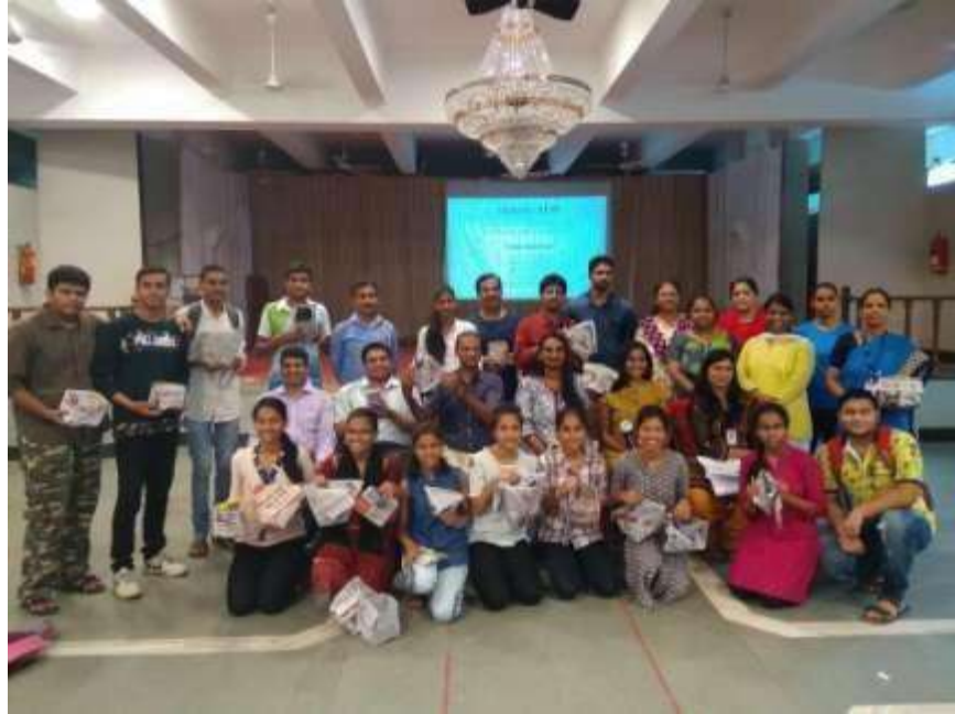
Awareness of Plastic Ban in collaboration with the Vakola ALM