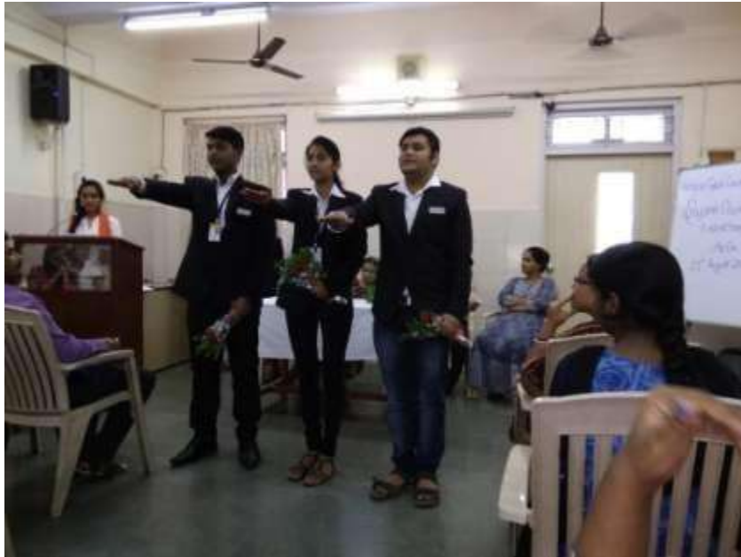
Formation of the Students' Council