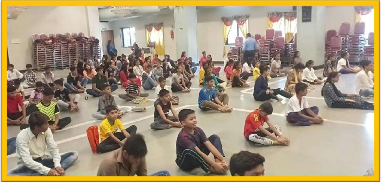
International Yoga Day Celebration