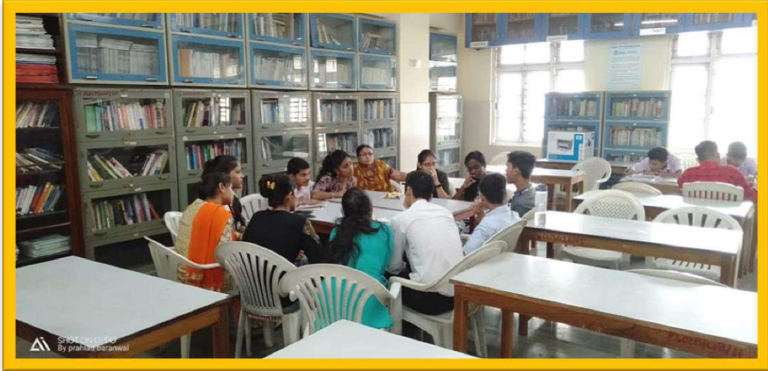
Heart-to-Heart Counselling Session