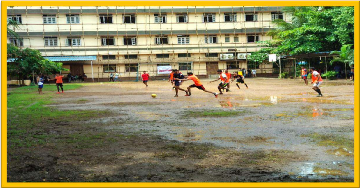
Football Tournament Between Alumni & Current Students