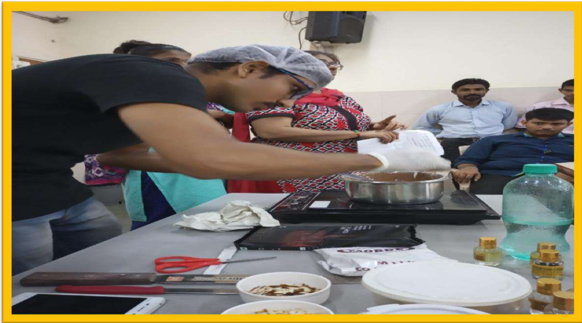
Live Demo of Chocolate Making