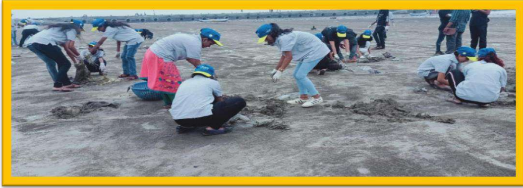
Beach Cleaning Drive