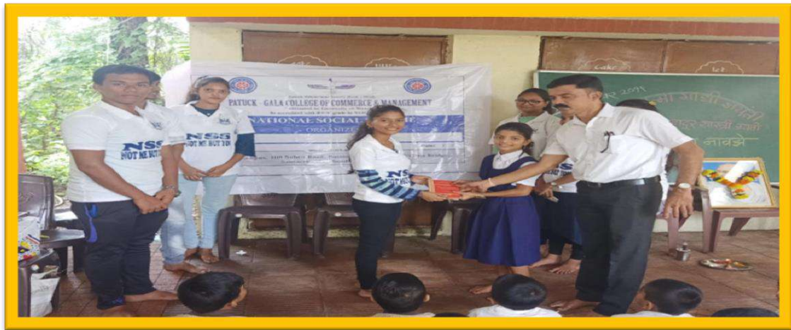
Donation at Saphale Village