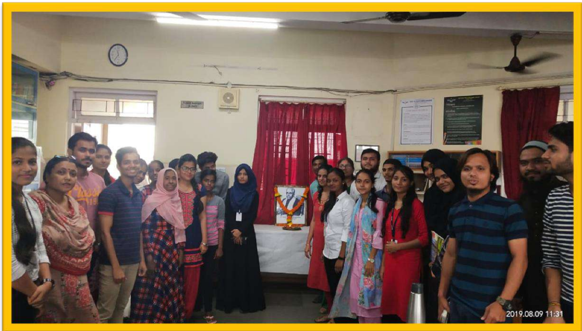
Father of Library Science Celebration