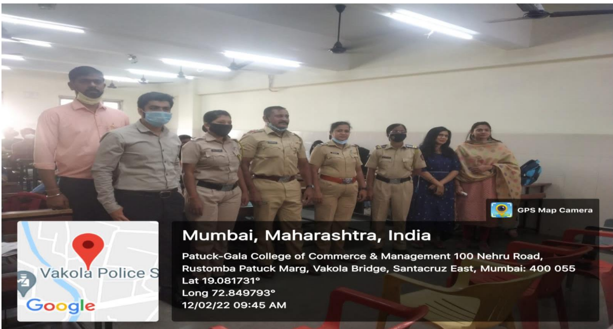
Cyber Security Session By Personnel of the Vakola Police Station